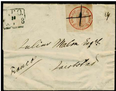
A 1895 cover showing one of the first Finnish stamps

From the 1300s until the early 1800s Finland formed part of the Kingdom of Sweden. A few stampless cover letters written by private individuals are known from that era. Most letters at that time were sent by officials, members of the royal family, the clergy and the upper classes. Letters were carried by private courier until the Finnish postal system was established in 1638. Once the postal service took over mail delivery its clerks usually wrote a "recording number" in the upper left corner of the cover. This is how these early Finnish stampless covers can be identified today. In addition to the national postal service, various provinces also established internal mail delivery systems in the 1600s.