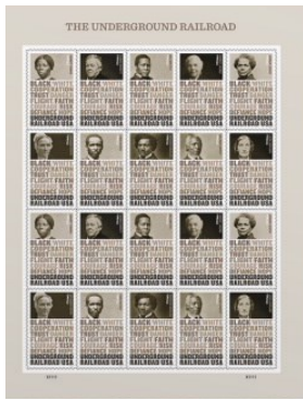
March 9—Ten forever commemorative