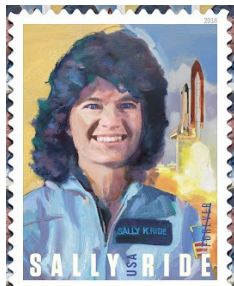
US Scott # 5283

Jun 3 —Club Meeting & Program - In Person & Zoom; Weird Stuff First Day Covers - from the Simple to the Sublime and Sometimes Silly; Video by Lloyd de Vries