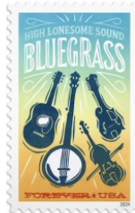
March 15 Bluegrass forever commemorative stamp is pane of 20