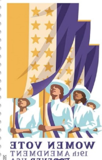
US Scott # 55232