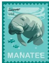
March 27 Save the Manatees, Single forever stamp, double-sided pane of 20