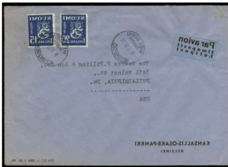
Cover from Helsinki, the capital of Finland. Note that the stamps read “Suomi” and “Finland”. This stamp issue was used from 1930 until 1952

Starting in the 1880s many Russians became angry at the