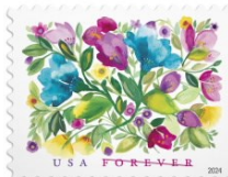
March 22 Celebration Blooms forever special stamp, Single in pane of 20