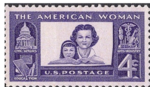
US Scott # 1152