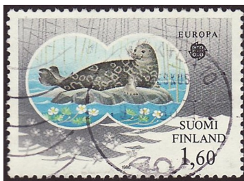
1986 Europa stamp showing a seal emphasizing nature conservation

As Finland matured as a democracy its economic situation improved until currently its citizens enjoy a living standard among the highest in the world. Accordingly the nation has issued many attractive modern-appearing postage stamps. One feature of the modern Finnish postal system is that customers can pay an extra fee and place their own photos on personal-