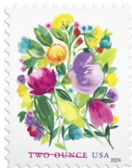
March 22 Wedding Blooms, Single two-ounce special stamp in pane of 20