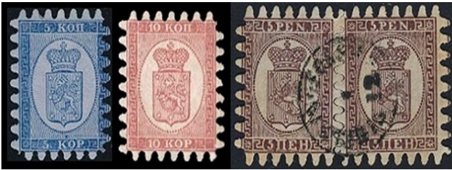
1860 and 1866 stamps showing serpentine rouletting

This was often done with gauge 7.5 or gauge 8 (that is, 7.5 or 8 serrations per 2 centimeters). These early rouletted stamps are still sought by philatelists due to their many subtypes of rouletting and paper. (To put it is U.S. stamp