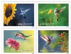
March 16 Garden Delights, four forever stamps, double-sided pane of 20.