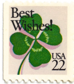
US Scott # 2271

Saint Patrick's Day is a religious and cultural holiday held on 17 March, the traditional death date of Saint Patrick (c. 385– c. 461), the foremost patron saint of Ireland.