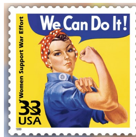
US Scott # 3886