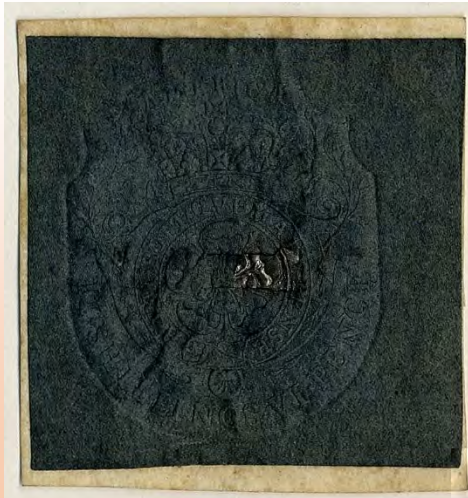
Proof and embossed stamp from the Stamp Act of 1765