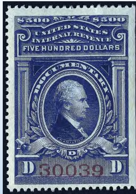
$500.00 Alexander Hamilton Revenue Stamp from 1917

Image by U.S. Bureau of Engraving and Printing; Restoration and imaging by Gwillhickers - United States Government; Dept. Internal Revenue, Public Domain, https://commons.wikimedia.org/w/index.php?curid=36344203