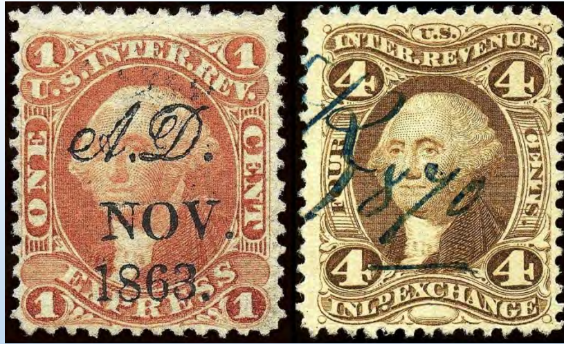
1862 U.S. Revenue stamps

Image by Butler & Carpenter of Philadelphia; Restoration and Imaging by Gwillhickers - United States Government; Dept. Internal Revenue, Public Domain, https://commons.wikimedia.org/w/index.php?curid=35954761