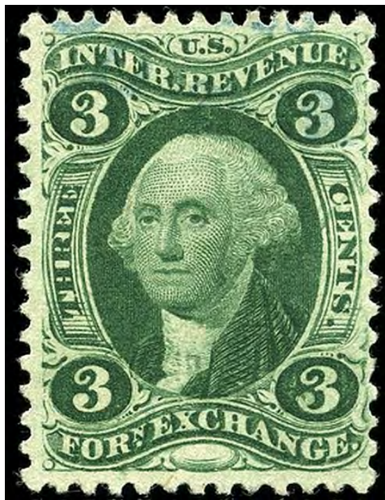
1862 Foreign Exchange Revenue Stamp

Image by Government commissioned printing by Butler & Carpenter of Philadelphia; Restoration and imaging by Gwillhickers - United States Government; Dept. Internal Revenue, Public Domain, https://commons.wikimedia.org/w/index.php?curid=36065182