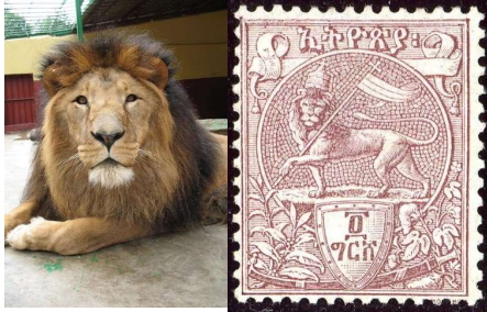
Photo by Jean-Francois Paumier; Permission is granted to copy, distribute and/or modify this document under the terms of the GNU Free Documentation License , Version 1.2 or any later version published by the Free Software Foundation ; with no Invariant Sections, no Front-Cover Texts, and no Back-Cover Texts. A copy of the license is included in the section entitled GNU Free Documentation License . https://commons.wikimedia.org/wiki/File:1894_4G_Ethiopia_unused_Mi5.jpg

As the newest member of the Ethiopian Philatelic Society I have no business writing for Menelik's Journal. I have never been to Africa nor do I seriously collect Ethiopia's stamps. But then I rarely run with the pack. When Ulf Lindahl suggested that I describe my interest in Ethiopian philately I forged blindly ahead.